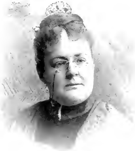
HARRIETT M. LOTHROP.

LOTHROP, Mrs. Harriett M., author, born in New Haven, Conn., 22nd June, 1844. She is best known as "Margaret Sidney." She was the daughter of Sidney Mason Stone and Harriett